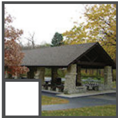
GILBERT PARK 9AM-DUSK