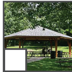
PATRIOTS PARK 9AM-DUSK