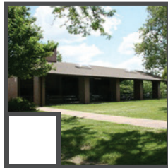
HUMMER PARK 9AM-DUSK