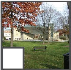
FISHEL PARK 9AM-8:30PM

OPERATING HOURS OF EACH PAVILION LISTED BELOW. CHECK THE BOX BELOW FOR THE PAVILION REQUESTED.