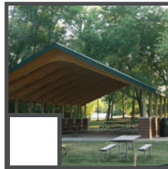
MCCOLLUM PARK 9AM-DUSK